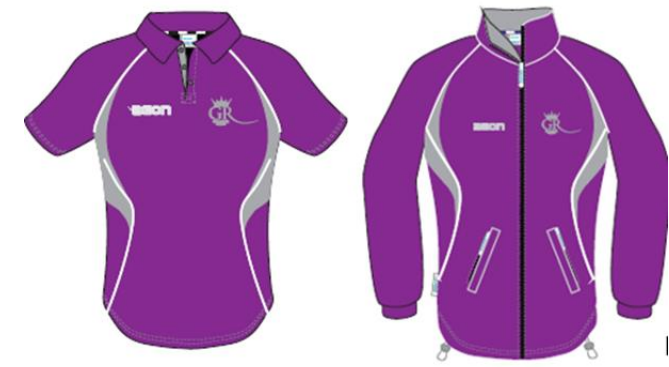
Club Polo & Lightweight Jacket