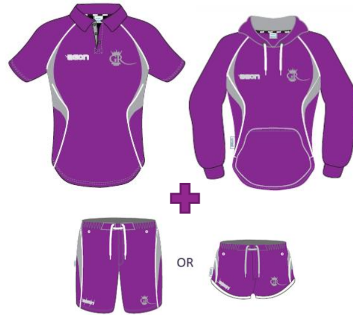
polo, 'north bay' hoodie & shorts