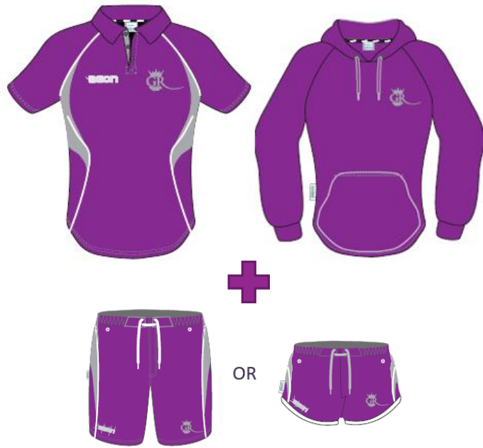
polo, hoodie & shorts