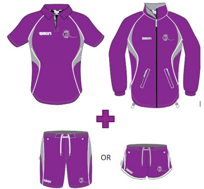
polo, lightweight jacket & shorts