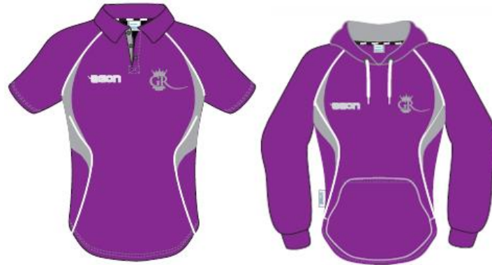
Club Polo & ‘North Bay’ Hoodie