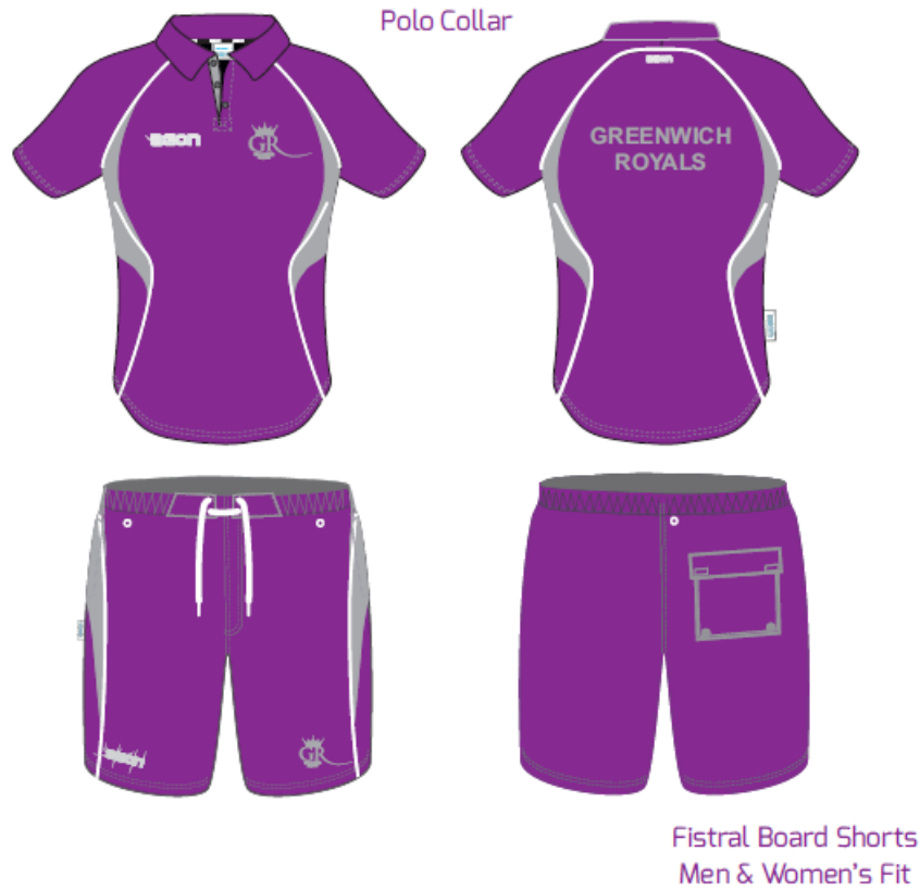
EV0365 Performance Shirt - Design 1 Fabric: NxGen160 - Moisture Management - Breathable - Quick Dry