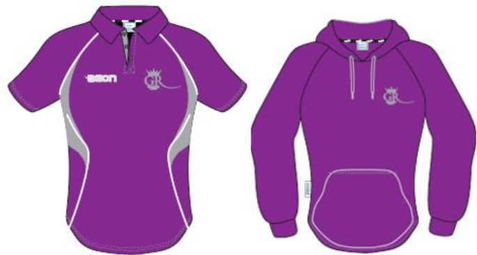
Club Polo & Hoodie

From time to time the Club may offer kit bundles at a reduced cost or including a ‘freebie’ such as a hat